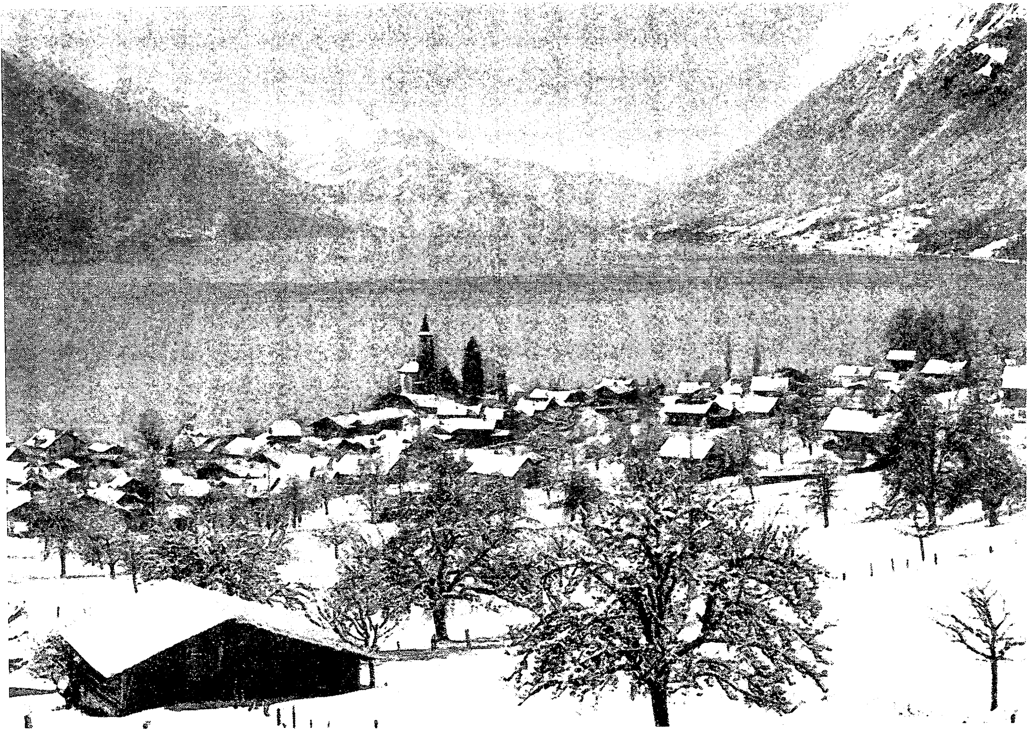
Brienz in the Winter