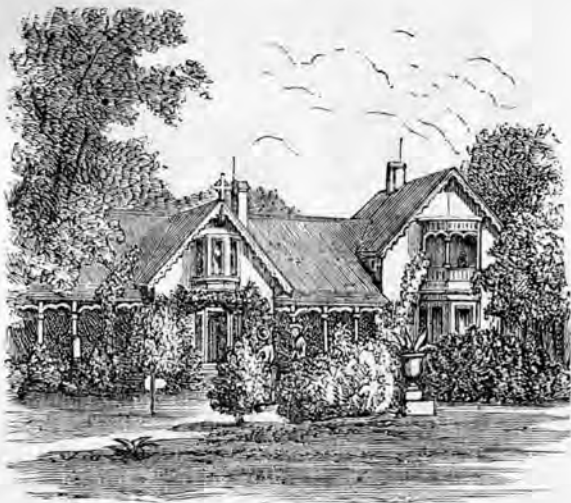
RESIDENCE OF BISHOP QUINTARD.

Pleasantly located, at not remote distances from each other, are some forty or more tasteful and even elegant cottages, exhibiting very much the same variety in style of architectural construction, and the same ornate taste in their flower gardens and