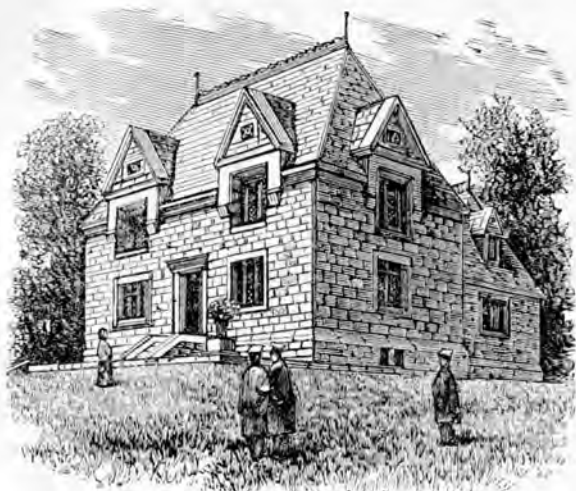
THE HODGSON LIBRARY.