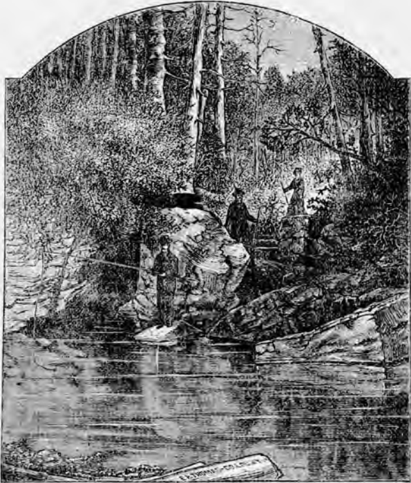
LAKESIDE VIEW IN THE DELLS OF THE CUMBERLAND, NEAR MONT EAGLE SPRINGS.