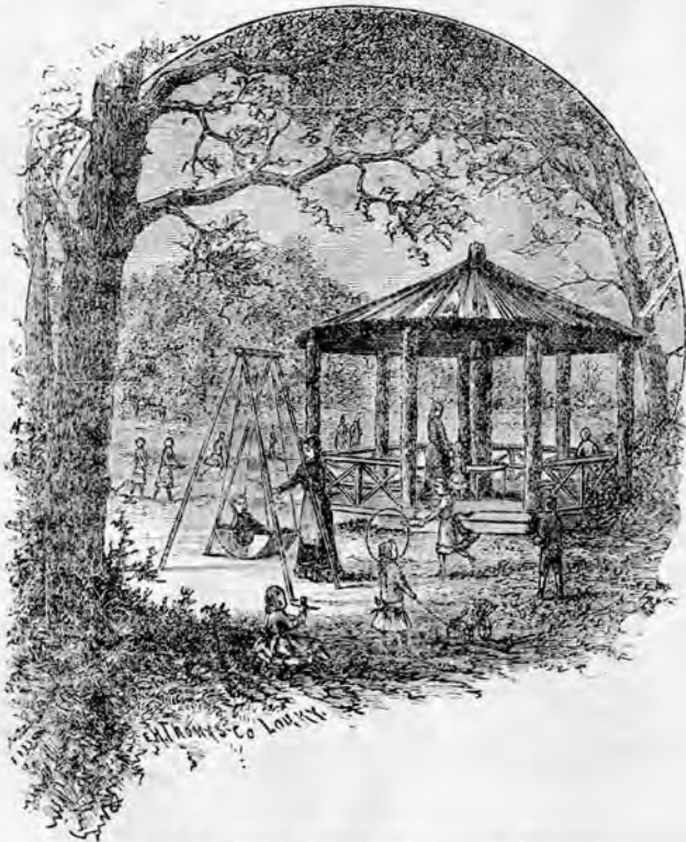
PAVILION IN CHILDREN'S PLEASURE GROUND.

The grounds in front of the building have been greatly beautified—laid off in English gardening style, having drives, walks, rock-work, fountains, and in the immediate front a picturesque pagoda for a music stand.