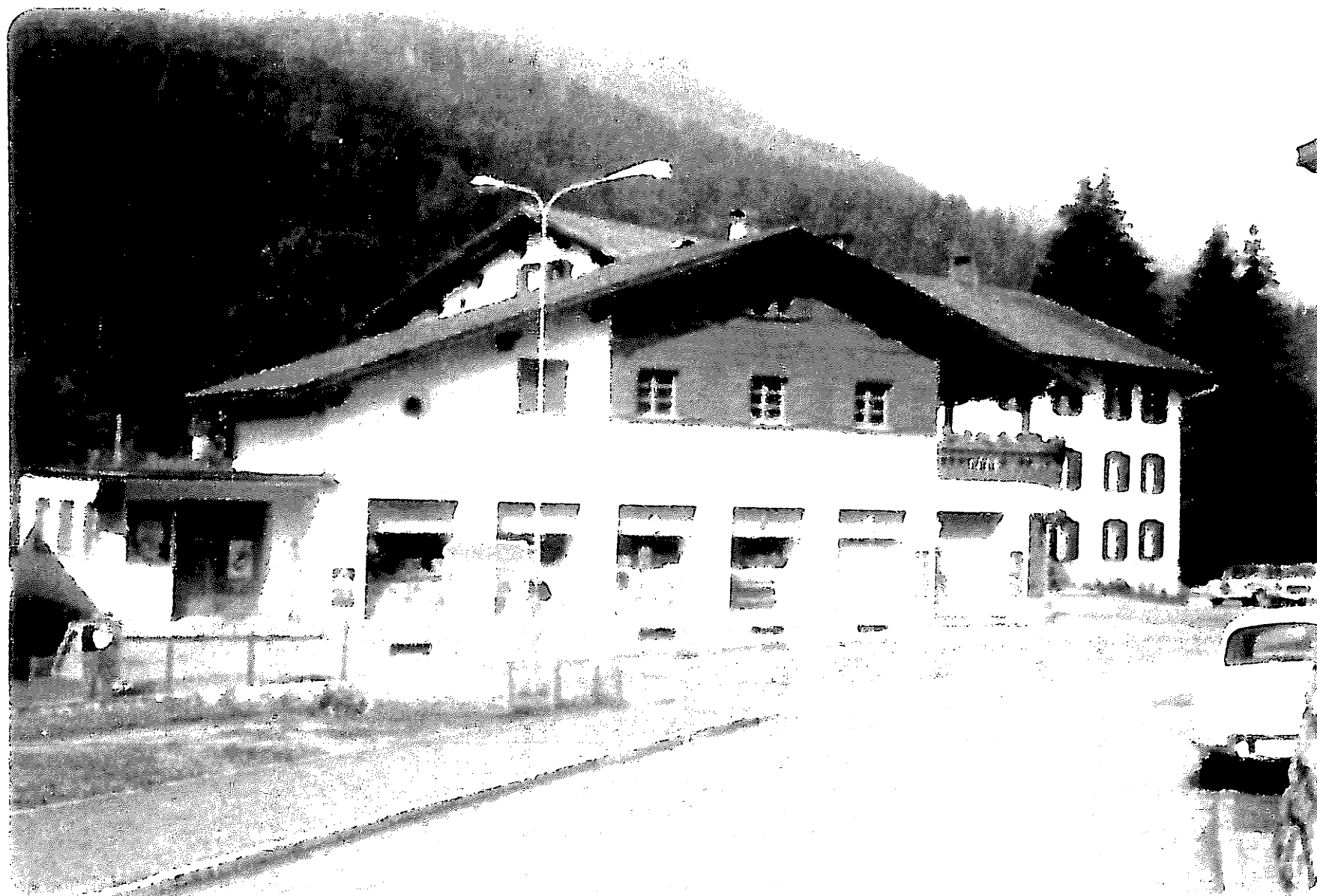
Marugg Ancestral Home in Klosters, Commercial Shops in Front of Main Living Quarters and Guest Rooms