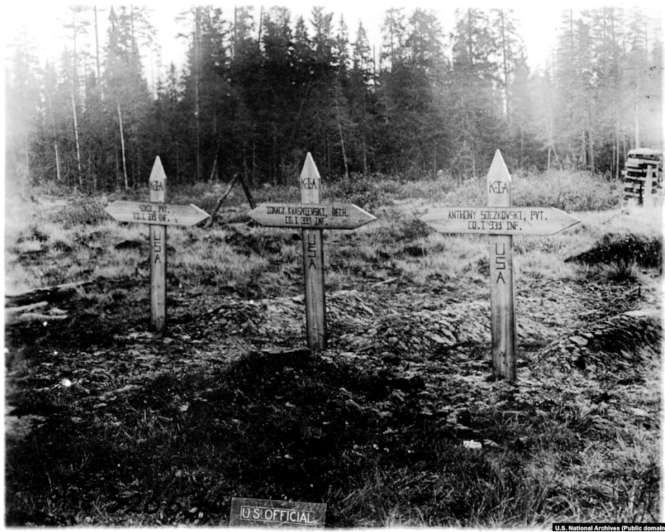
Above, wooden crosses mark U. S. burials in Russia Below, some soldiers have stones.