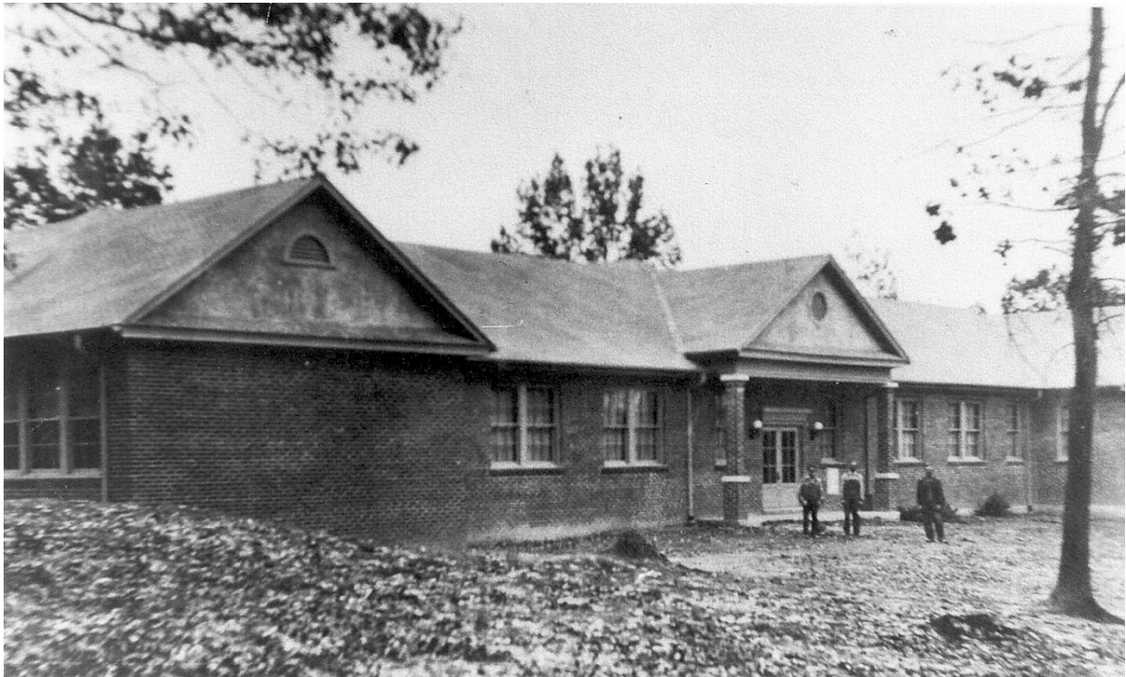
The last labor pain; putting the finishing touches to the new building