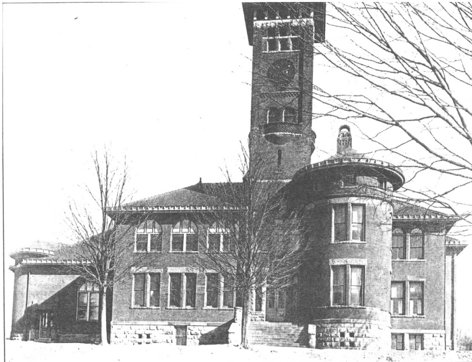
Shook High School (1925)