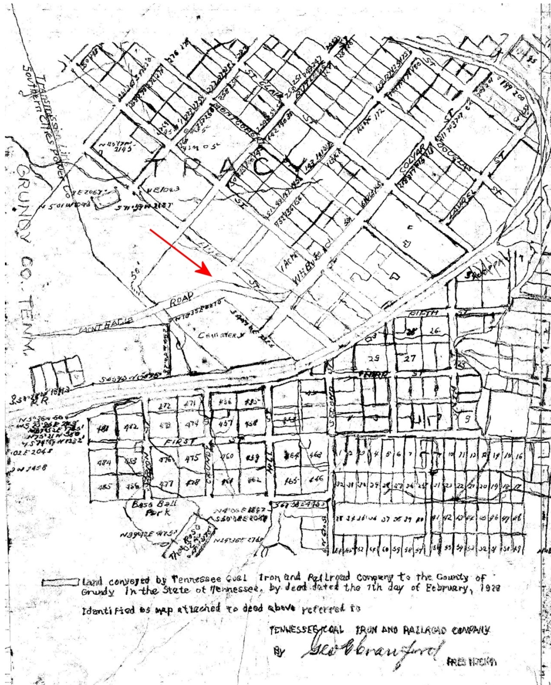
The map above is part of the deed involving the land bought for the high school.