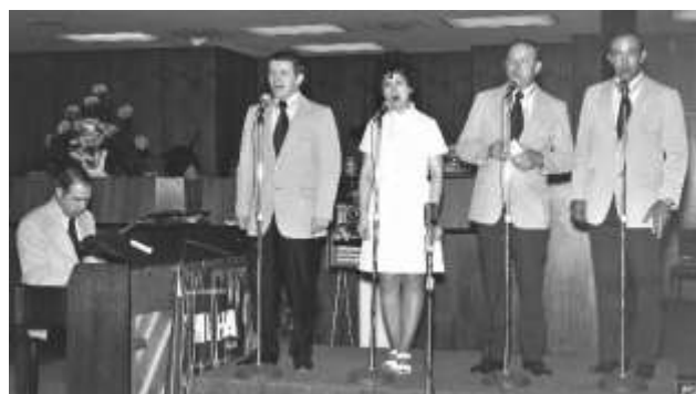
This photo taken at one of the many concerts presented by the group.