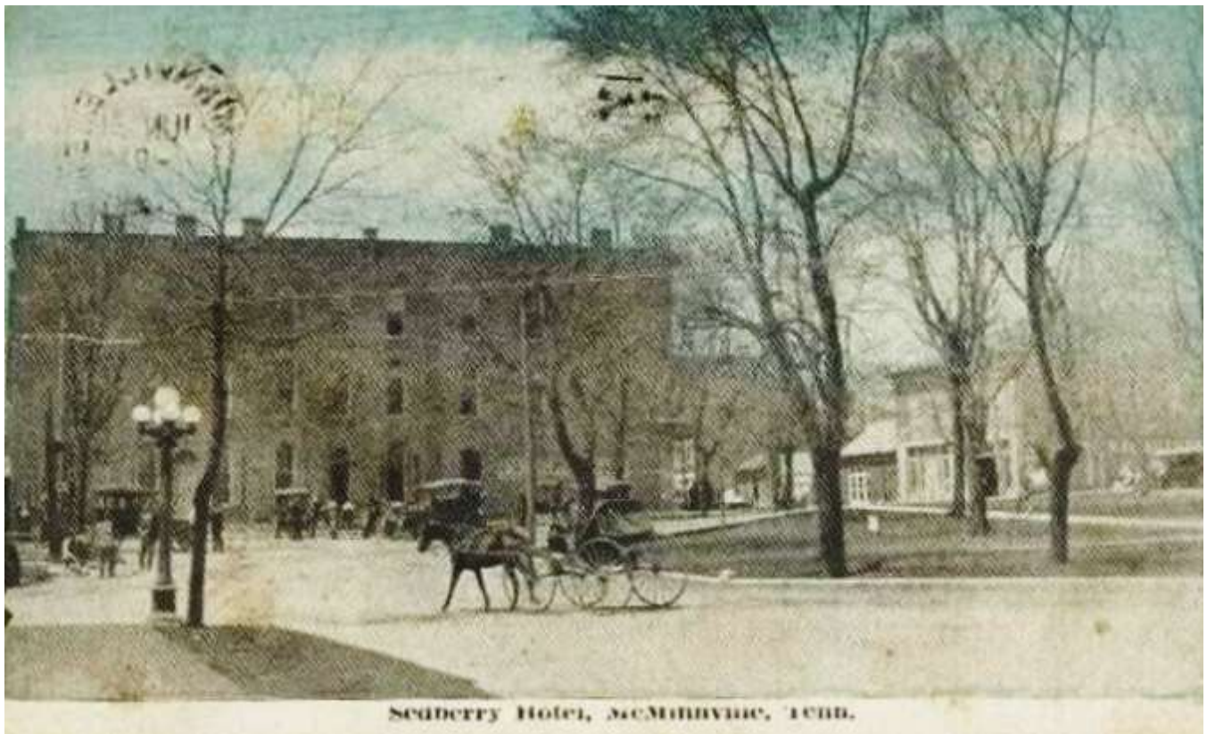
Sedberry Hotel, court square 1900's

You're invited to join our Facebook group, comment and submit photos and history.