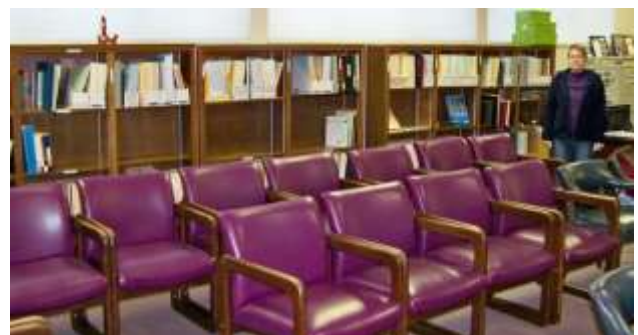
There's lots of space for anticipated family and historical files.