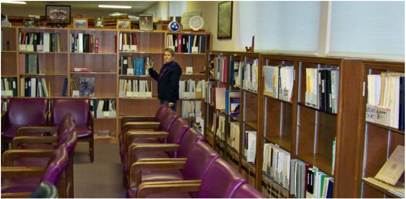
Organizing our files have been an ongoing project for the past couple of months.