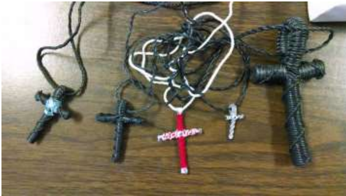
Mexican inmates first made the crosses and showed other inmates how to make them from plastic bags. Questions? What did they have to cut the plastic with and How did they get the material?