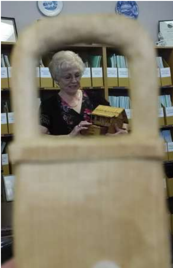
Looking through the wooden lock and key.