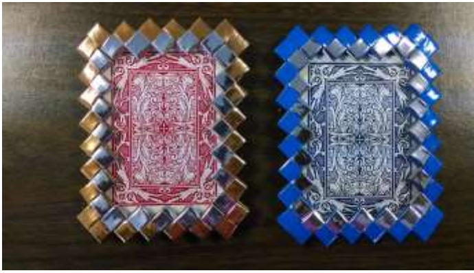
Picture frames made from candy wrappers and a deck of cards.