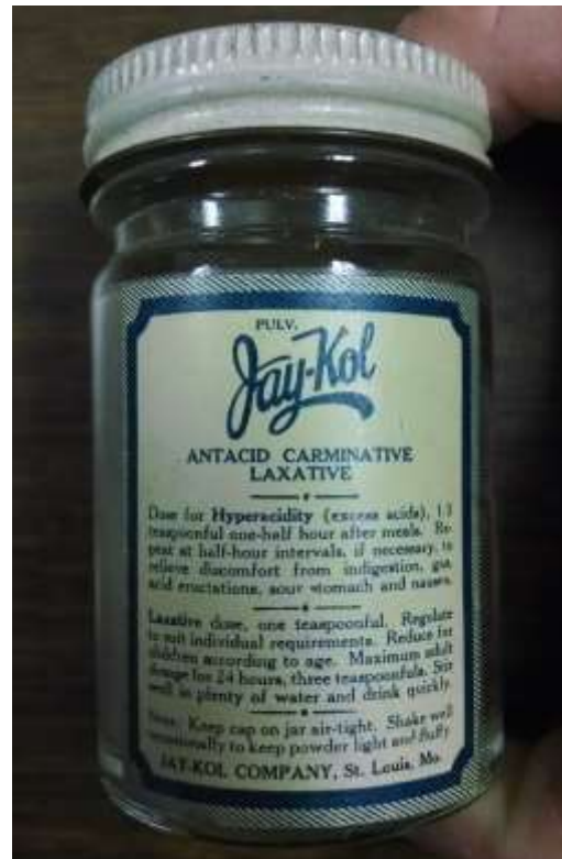
BOTTLE- PULV Jay-Kol ANTACID CARMINATIVE LAXATIVE

Does for Hypercidity (excess acids), 1-3 teaspoons one-half hour after meals. Repeat at half-hour intervals, if necessary, to relieve discomfort from indigestion, gas, acid eructations, sour stomach and nausea.