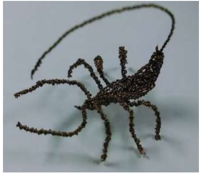
Scorpion - where did they get the wire?