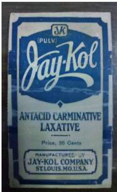
Label: JK (PULV) Jay-Kol Antacid Carminative Laxative - Price, 35 cents - Manufactured by JAY-KOL Company St. Louis, MO, USA.

Note: Keep cap on jar air-tight. Shake well occasionally to keep powder light and fluffy.