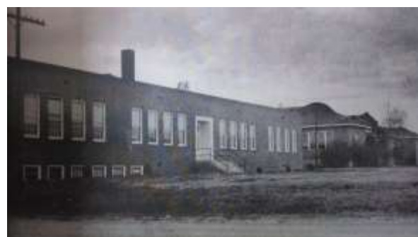
1946-47 Morrison School.