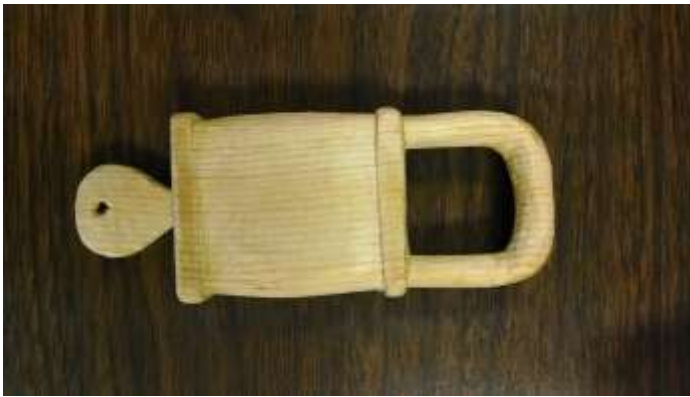
A wooden lock and key whittled with what?