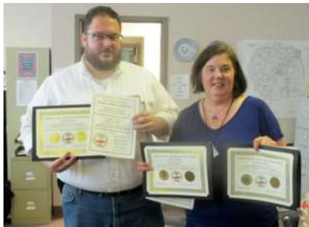
In 2016 Warren County-McMinnville First Pioneer Families Certificates were presented to