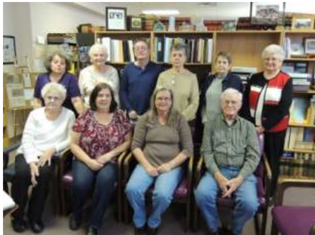
2017 WCGA Officers & Committee Chairs

Visitation was scheduled from 12:00 noon to 2:00 pm Saturday, January 14, 2017 in the Parlor at High Funeral Home. Funeral services were conducted at 2:00 p.m. with family and friends officiating. Burial followed at Mt. View Cemetery.