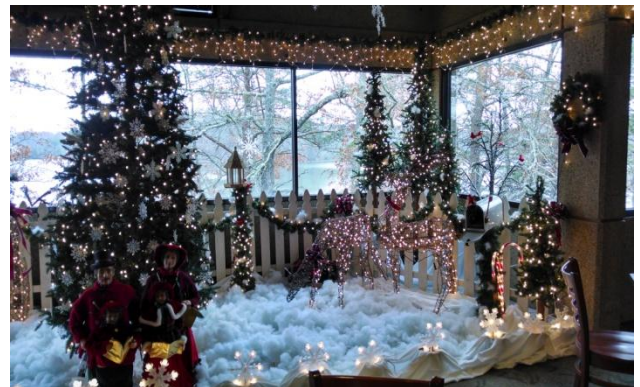
Beautiful Christmas decoration for our WCGA luncheon was enjoyed by all.